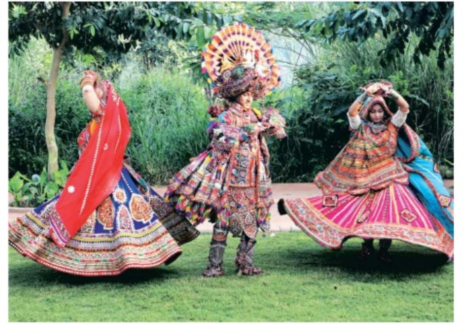
A dance group from Ahmedabad performs a full-dress rehearsal of garba at Parimal Garden on Sunday ahead of the Navratri festival. The specially designed turban is themed on PM Narendra Modi and the Chandrayaan-3 mission.

The state government has allocated Rs 100 crore to 157 municipalities to repair and resurface roads damaged in the monsoon season, CMO stated. While 22 Class A municipalities will get Rs 1 crore, 30 in Class B will get Rs 80 lakh, 60 in Class C will get Rs 60 lakh and 45 in Class D will get Rs 40 lakh.