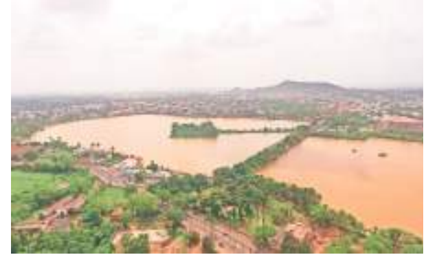
Hamirsar lake in Bhuj on Sunday. Mayur Pomal

The long-term annual average rainfall in Bhuj is just