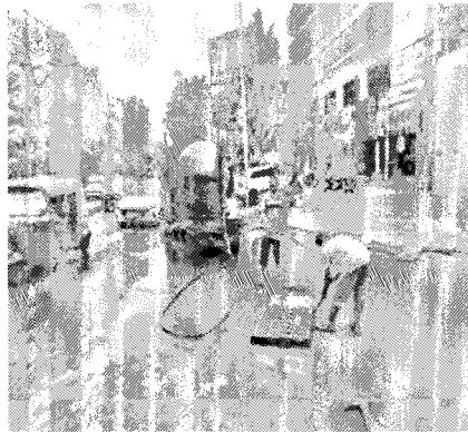
Maintenance work in progress to declog drainage line at SV Desai Marg in Vadodra on Sunday.