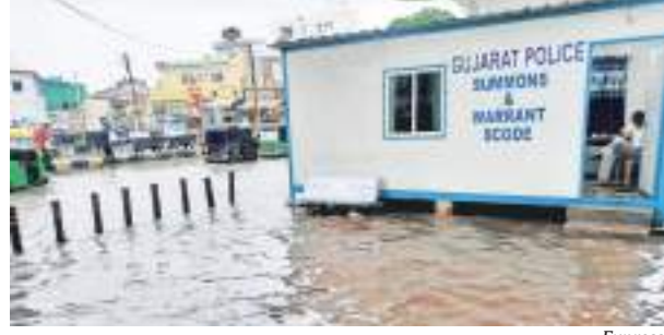
Water-logging at Ring Road near Nana Muva Circle in Rajkot; (below) Work in progress at the site where a road caved in near Dariyapur Darwaza in Ahmedabad Sunday.

Among districts, other than Kutch, Junagadh has recorded the highest rainfall of 77 per cent of